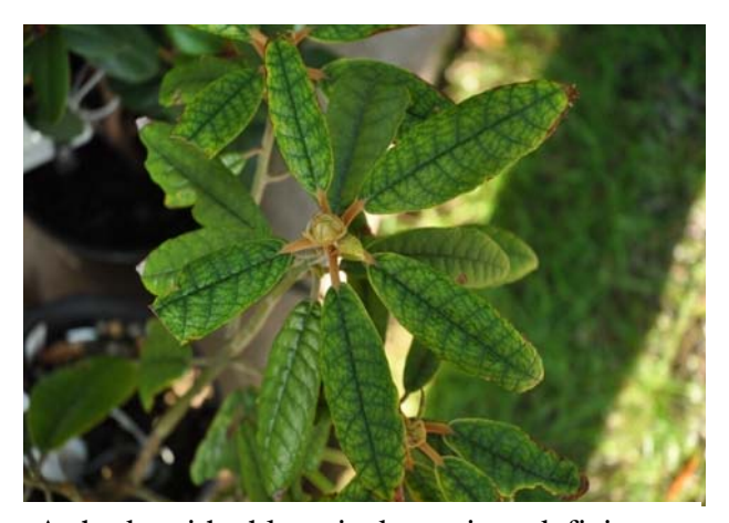
A rhodo with chlorosis due to iron deficiency.

As the pH rises (soil becoming more alkaline, or sweeter) two things happen. First iron becomes unavailable. In rhodos this leads to chlorotic leaves with yellow veins. Secondly Ca (calcium) becomes more available. That is bad for rhodos which need some calcium, but not too much, though there is still scientific debate as to whether it is the calcium or the carbonate which goes with it that causes the damage. That is why one should never use regular lime on rhodos, as it is mainly calcium carbonate. Instead, if the soil needs sweetening, use dolomite lime, which is slower acting, but contains a lot of Mg (magnesium) in place of the calcium, and thus does less damage. Normal pure rainwater has a pH of 5.6, but the pH can be much lower in polluted areas (acid rain). Some of this acid is neutralized by elements in the soil, depending on the soil type. But the end result is that in our rainy climate the soil tends to be naturally acid, part of the reason we can grow rhodos so well. In extremely rainy areas the soil may get too acid and so some people in such areas use a bit of dolomite lime on their rhodos. In our garden the pH seems to be around 6, so I have never found