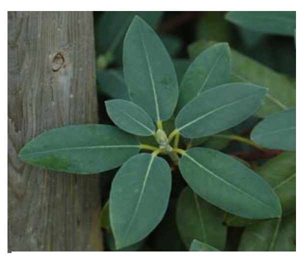
A rhododendron with healthy leaves.